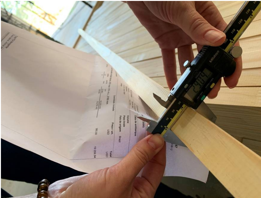
Picture 3 Thickness