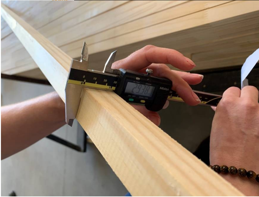
Picture 2 Width