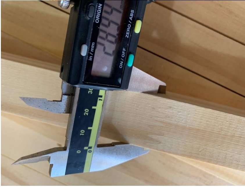
Picture 8 Thickness