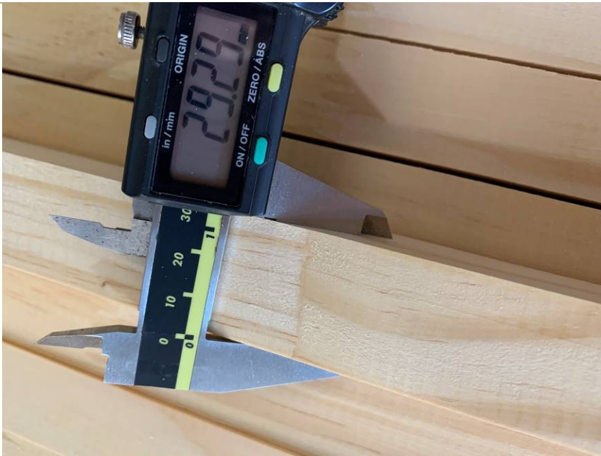
Picture 10 Width