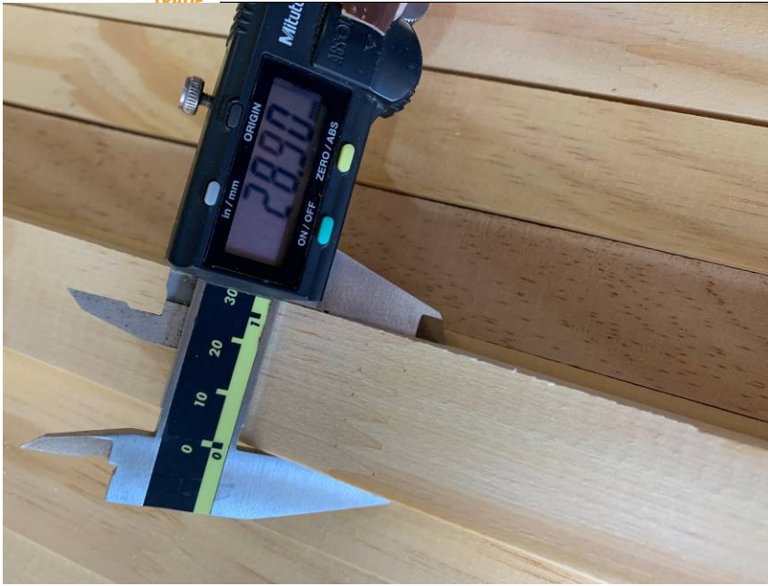
Picture 6 Thickness