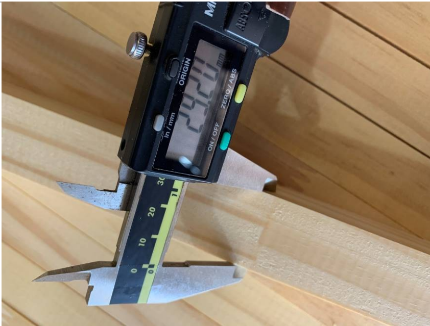
Picture 7 Width