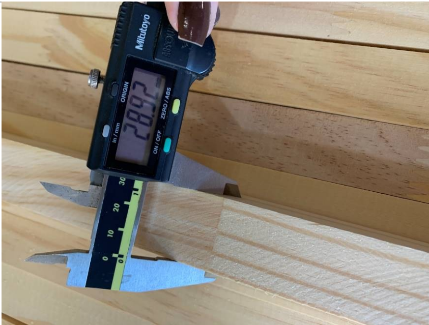
Picture 5 Width